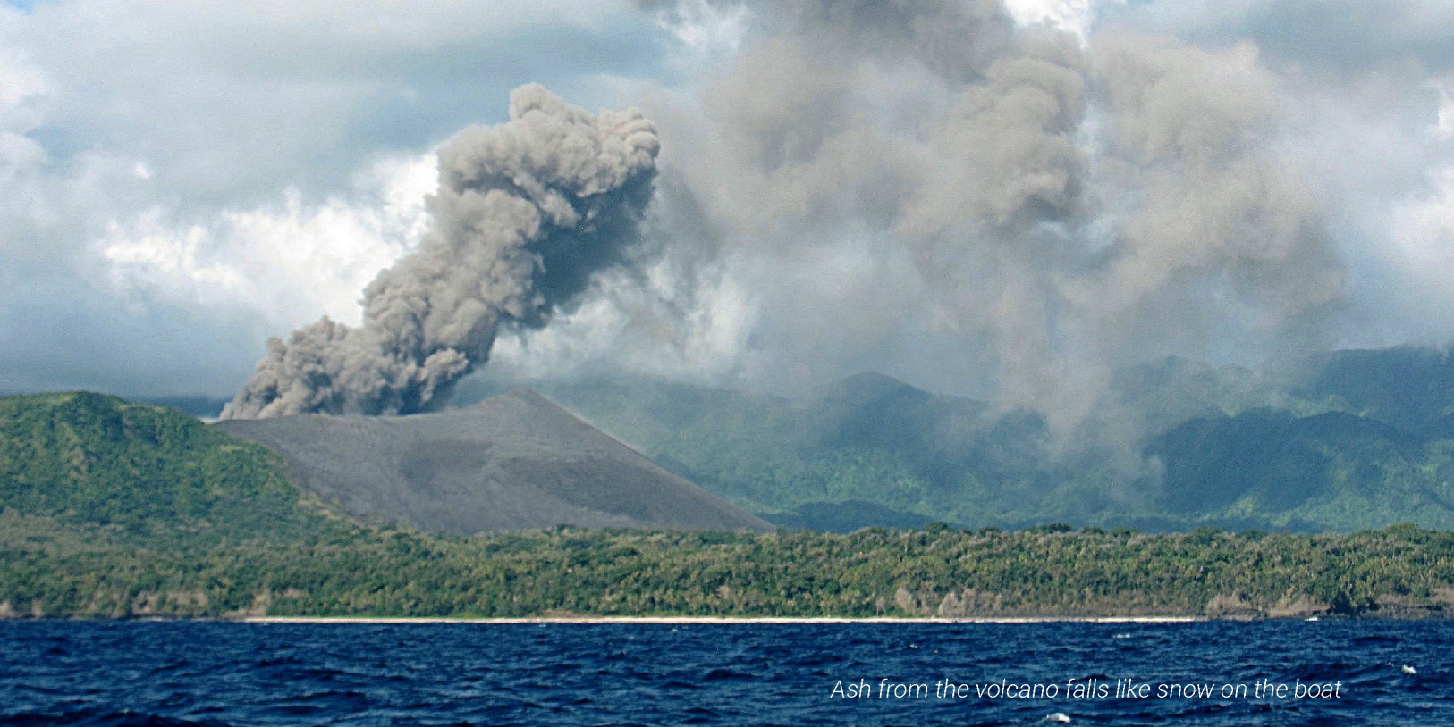
Ash from the volcano falls like snow on the boat